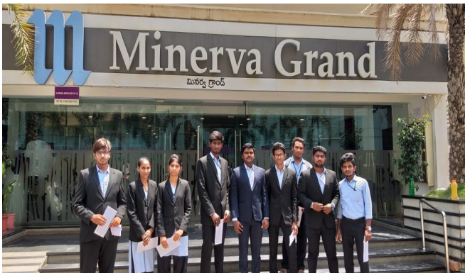
Short Duration Internship at Minerva Grand, Vijayawada

To Provide Practical Training to First Year MBA Students to Industries, Continuous Internship Practice is introduced. Students are given an opportunity to Learn Things Practically by Visiting to Industries during their Course.