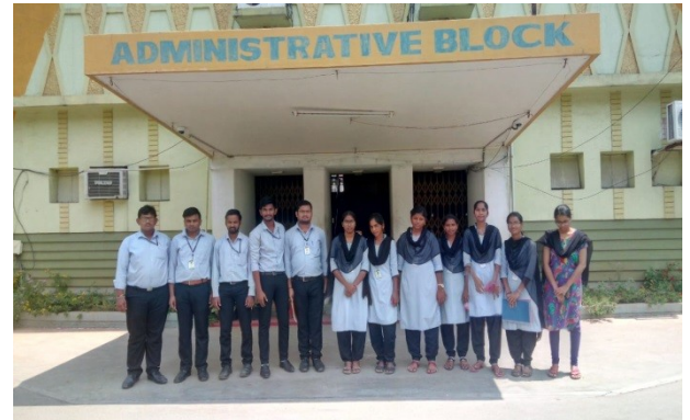
Short Duration Internship at The Krishna District Milk Producers Mutually Aided Co-op Union Limited, Vijayawada